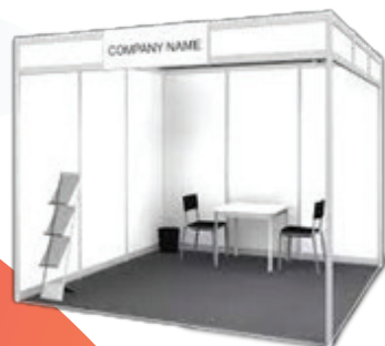
Firstline Exhibition Space Custom Shell/Basic Shell 9Sqm – 12Sqm

The stand can be built from scratch and or customized Shell scheme, modified to project your brand.