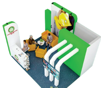
Frontline Exhibition Space Bespoke/Custom Shell 12Sqm – 20Sqm

Island spaces are allocated within the central atrium and minimum of 0.5m perimeter.