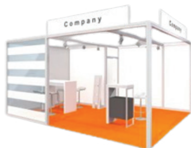
Foreline Exhibition Space Bespoke/Custom Shell 9Sqm – 12Sqm

The stand is built from scratch and the finished stand completely unique to your company.