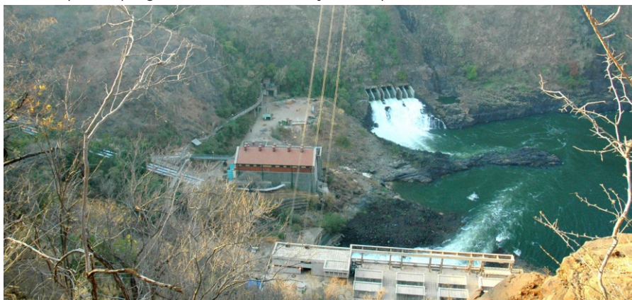
Victoria Falls Zesco Power Station

With a new terminal building, runway, apron and apron lights, the airport is the focus of the Corporation. Livingstone International Airport is situated 5km from Livingstone town, the tourist capital, in the Southern Province and perhaps more significantly, 15 km from the Victoria Falls. The Airport was built in 1950 for a predominantly domestic market, but the airport infrastructure has been considerably up-graded through major redevelopment programmes undertaken by the Corporation.