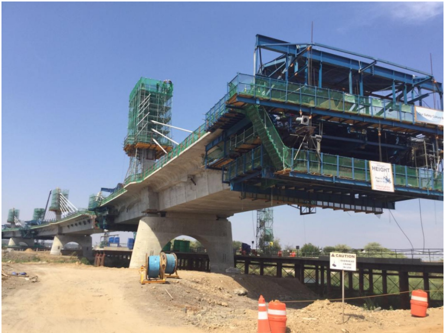
Kazungula Bridge under construction