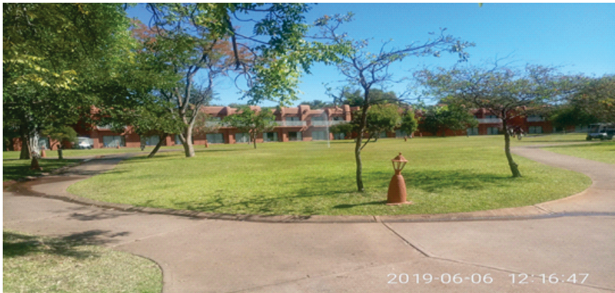
AVANI Victoria Falls Resort Lawns

As we commit to the SDGs, we commit to ensuring good health and well-being for all among other issues such as education, gender equality and sustainable engineering development.