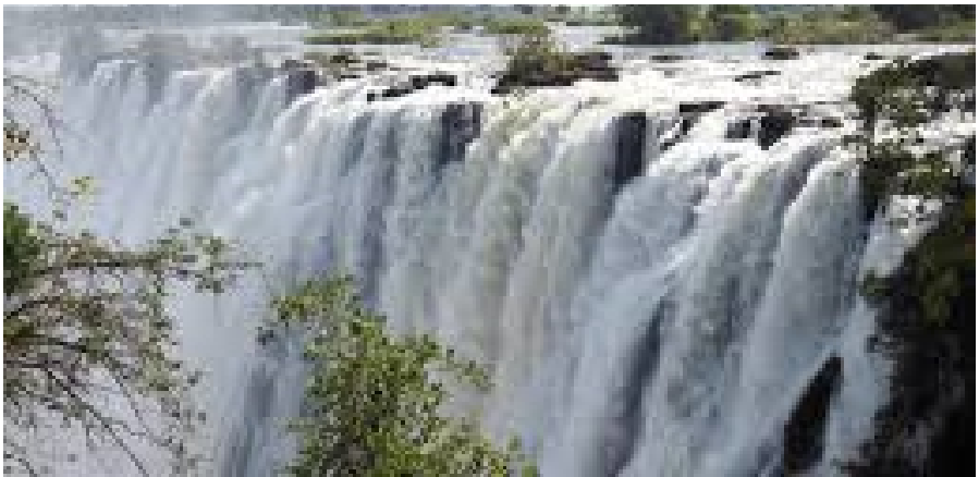
Victoria Falls one of the seven wonders of the world located in Livingstone - Zambia