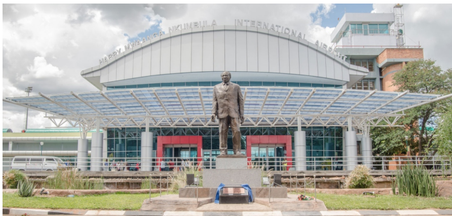
Harry Mwaanga Nkumbula International Airport

Harry Mwaanga Nkumbula International Airport (formerly Livingstone International Airport) brings you closer to the magnificent 'Smoke that Thunders' - The Victoria Falls Mosi-oa-tunya. A stone through away from one of the Seven Wonders of the World, Harry Mwaanga Nkumbula International Airport is the second oldest airport after Simon Mwansa Kapwepwe (Ndola) but stands out as the pride of the country due to its rehabilitated facilities.