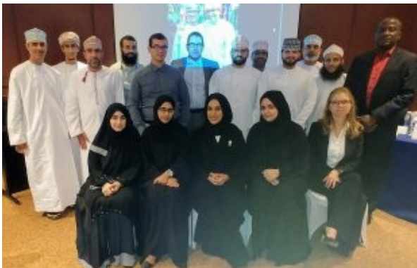
Project Economics Decision Analysis in Oil and Gas July 29 - Aug 2 2018, Muscat Oman