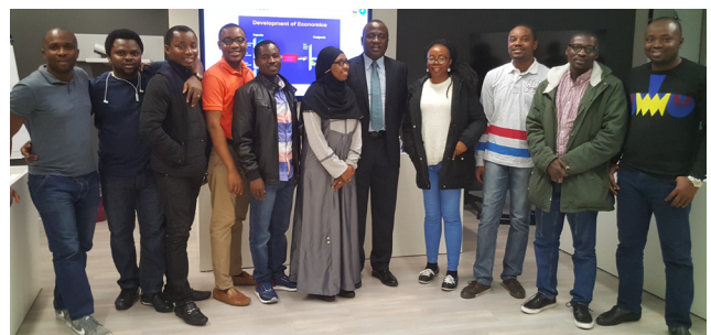
Project Economics and Decision Making - Nov 20 -24 2017, San Donato, Milanese, Italy