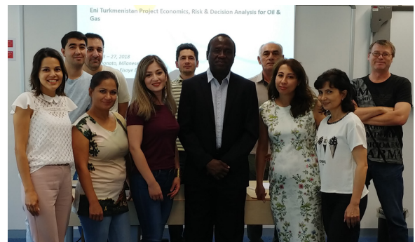
Project Economics, Risk & Decision Analysis for Oil & Gas - 23-27 July 2018, San Donato, Milanese, Italy