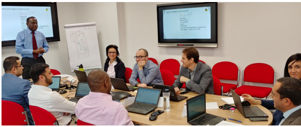
Project Economics, Risk & Decision Analysis for oil and Gas. 12th - 16th November 2018 Basingstoke, UK.