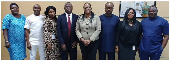
International Petroleum Agreements and Negotiations November 26 - 28 2018 Abuja Nigeria