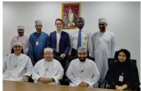
Economics of Oil & Gas Industry – 1-5 July 2018 – Muscat Oman