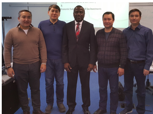
Economics of the Oil and Gas Industry & Economic Evaluation of Oil and Gas Investments Courses, Nov 28 - Dec 6. 2017. San Donato, Milanese, Italy