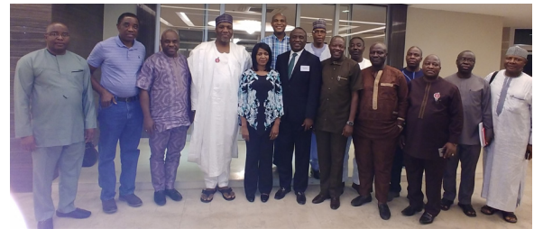
Senior Executive Workshop on Gas Monetization Economics and Investment Decision Making, November 24 2018 Abuja Nigeria