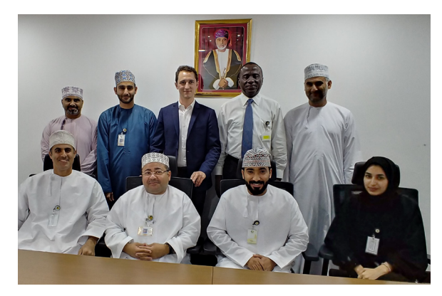
Economics of Oil & Gas Industry – 1-5 July 2018 – Muscat Oman