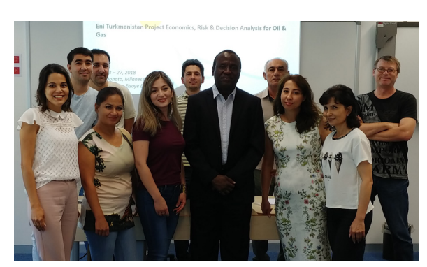
Project Economics, Risk & Decision Analysis for Oil & Gas -23-27 July 2018, San Donato, Milanese, Italy