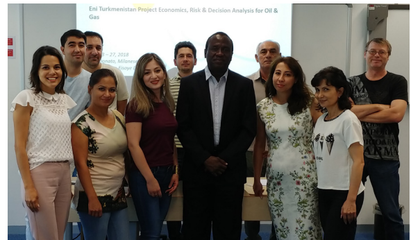
Project Economics, Risk & Decision Analysis for Oil & Gas - 23-27 July 2018, San Donato, Milanese, Italy