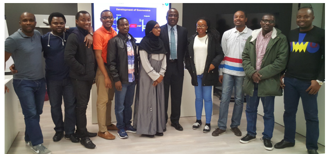
Project Economics and Decision Making - Nov 20 -24 2017, San Donato, Milanese, Italy