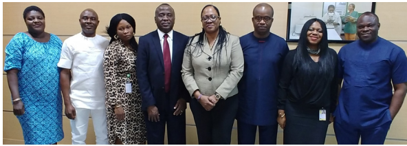
International Petroleum Agreements and Negotiations November 26 - 28 2018 Abuja Nigeria