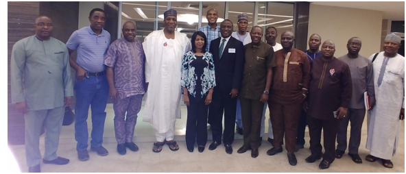
Senior Executive Workshop on Gas Monetization Economics and Investment Decision Making, November 24 2018 Abuja Nigeria